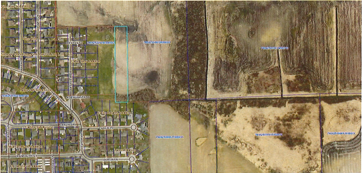
Aerial view of Annexation Area

In relation with the current boundaries of the City of Angola, Indiana (below)