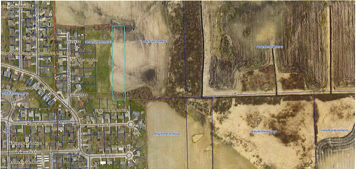
Aerial view of Annexation Area

In relation with the current boundaries of the City of Angola, Indiana (below)