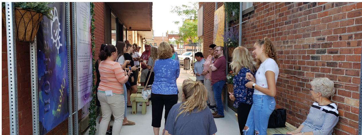
Opening ceremony for “Imagine Alley”

DOWNTOWN SERVICES SERVES AS A LIAISON TO DOWNTOWN BUSINESSES AND ORGANIZATIONS WHO ARE WORKING TOWARDS BUILDING AN INCREASINGLY VITAL AND THRIVING COMMUNITY. THE PROGRAMS THIS YEAR CONCENTRATED ON THE ENHANCEMENT OF ANGOLA'S CULTURAL ASPECTS.