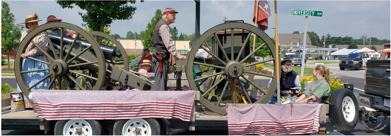
4th of July Parade- Civil War Re enactors' Float

BELOW IS A LIST OF EVENTS THAT OCCURRED IN AND AROUND DOWNTOWN ANGOLA.