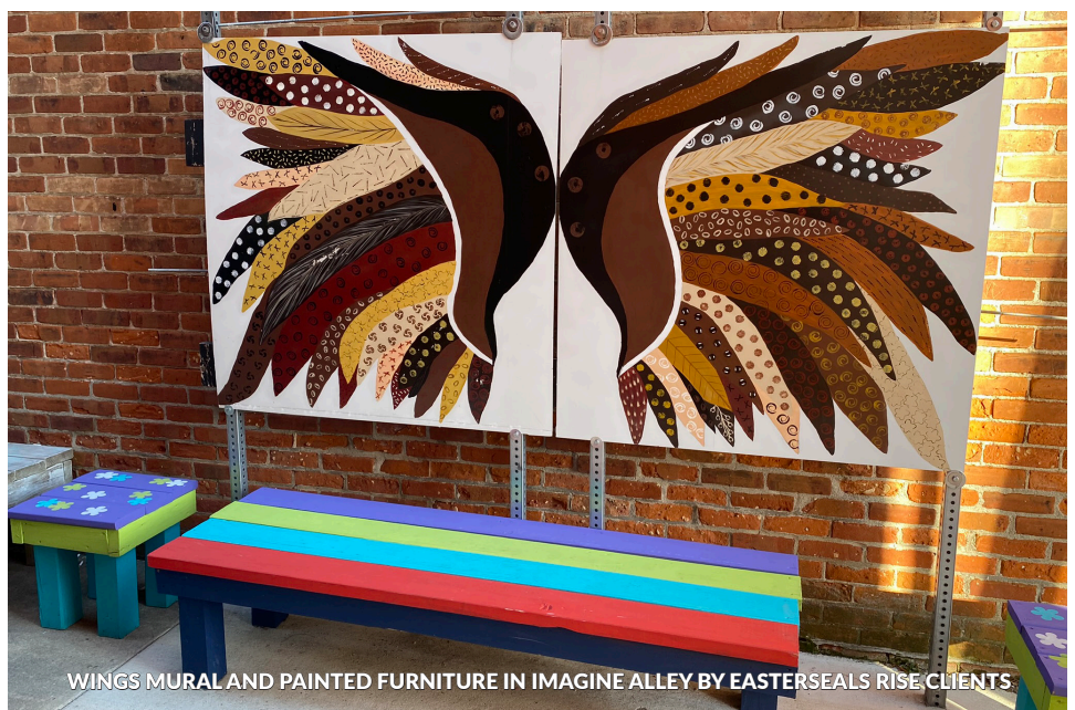
WINGS MURAL AND PAINTED FURNITURE IN IMAGINE ALLEY BY EASTERSEALS RISE CLIENTS