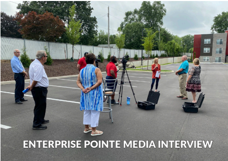
ENTERPRISE POINTE MEDIA INTERVIEW

Placemaking involves not only the physical space, but the way it is seen, valued, used, and contributes to community well-being and quality of life.